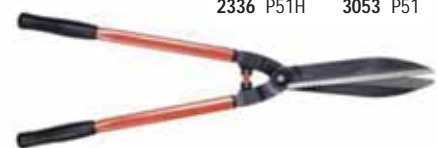
2336 P51H 3053 P51

Ideal professional secateur for heavy duty use. Modern lightweight carbon and glass fibre handles which rotate to reduce effort, prevent fatigue and increase user comfort. Stamped blades and counter blade with sap groove. P2-20 cutting cap. of 20mm. Length: 20cm (8"). P2-22 cutting cap. of 25mm. Length: 22cm (8 1/2")